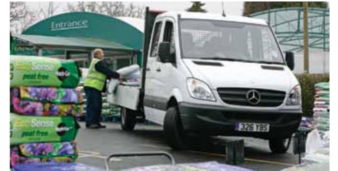
Sprinter is our larger van for higher payloads - but with exactly the same warranty as Vito.