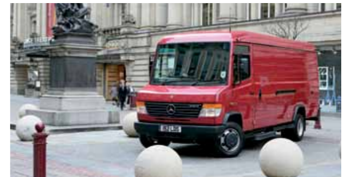
Vario is our specialist high volume van, also featuring a comprehensive warranty.