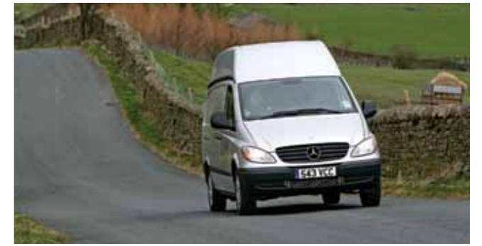
Vito is our light van, with a warranty that's ideal for local distribution and city centre work.