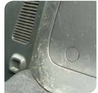
These images show examples of unacceptable damage