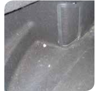
These images show examples of unacceptable damage