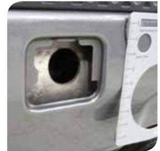
These images show examples of unacceptable damage